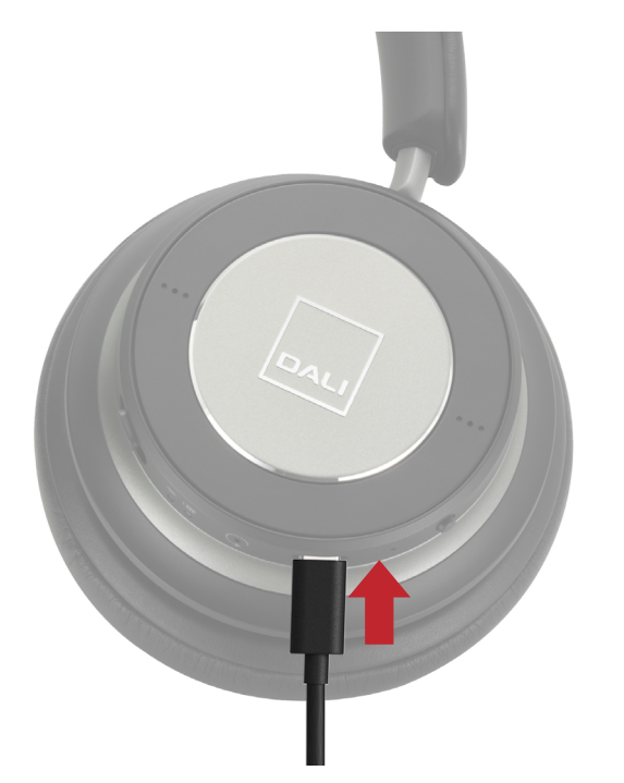
Connect the headphone to the computer using the USB cable.