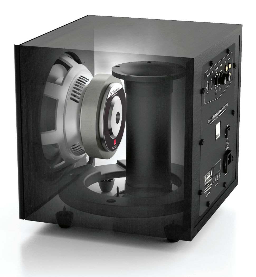
Any risk of port noise derived from the down-firing bass vent itself is seriously reduced by its convex tapered design. Apart from the shape of the flares the vent has also undergone extensive testing, measuring and listening when it comes to dimensions and placement, in order to optimize interaction with the cabinet and woofer.

Built on almost 30 years of knowledge in acoustics and cabinets, the solid MDF cabinet abides the tough DALI specifications. The enclosure comes in a choice of Black Ash, Light Walnut and White laminate finishes. The front baffle itself displays a High Gloss Black finish.