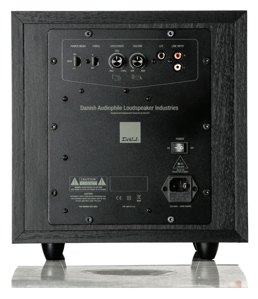
The high-efficiency amplifier needs no external heat sink.

The integrated 170 Watt RMS Class D amplifier is a highly linear construction. The DALI SUB E-9 F will follow and render the required signal with an absolute minimum of bias. Designed not only for continuous power, but also for peak power, this subwoofer is able to deliver 220 Watt Peak Power. This is very relevant when it comes to both movie and music signals.