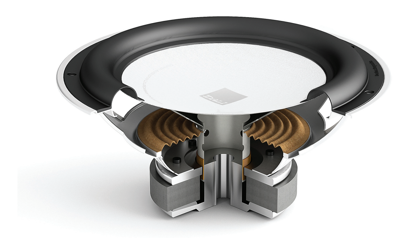
The woofer for the SUB E-9 F was developed from scratch by DALI's acoustic engineers.

The voice coil is 26.5 mm long, and built for long excursions. It is vented to ensure aircooling to the system, and the coil itself. Venting this 4-layer voice coil keeps the temperature down, and the benefit is a stable impedance response.