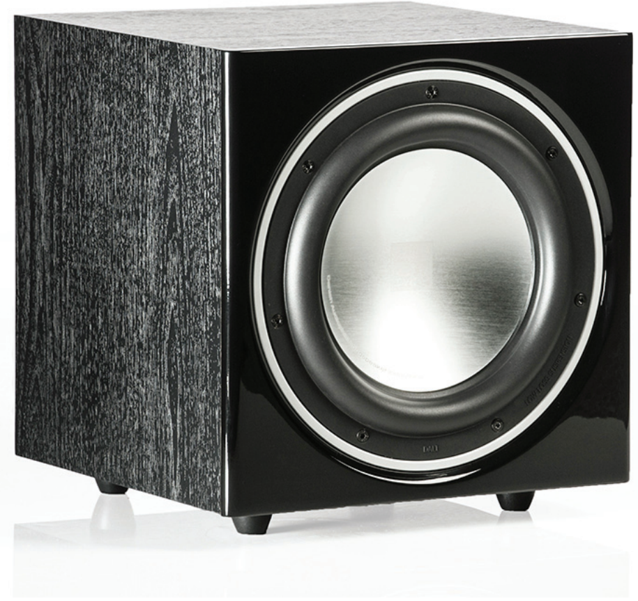
DALI SUB E-9 F

With the rising interest in high quality compact speakers the demand for a potent yet compact subwoofer is growing. The DALI SUB E-9 F was developed precisely to fill this demand. Build around a compact cabinet, a powerful amplifier and a stiff yet lightweight aluminum woofer.