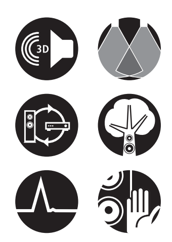
You can read more about our sound design principles at www.dali-speakers.com

Over the years DALI's engineers have developed a set of sound design principles. Today these are applied in the creation of basically any DALI speaker. Naturally our subwoofers must be able to enter into any setup without sacrificing the purpose of providing wide dispersion, time coherent and low-loss performance.