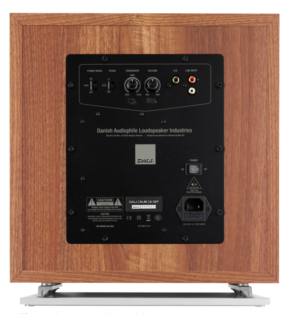
The high-efficiency amplifier needs no external heat sink.