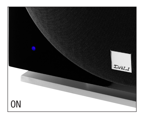
The power LED is integrated in the lacquered front baffle – completely invisible when off.

The front grille is held in place by concealed magnets, making it easy to remove it from the baffle. With the grille fitted the subwoofer discreetly blends into most domestic environments with its stylish High Gloss Black front baffle. Removing the grille reveals the impressive woofer with a laser-engraved DALI logo.