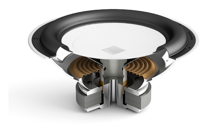
The woofer for the SUB E-12 F was developed from scratch by DALI's acoustic engineers.

The voice coil is 26.5 mm long, and built for long excursions. It is vented to ensure aircooling to the system, and the coil itself. Venting this 4-layer voice coil keeps the temperature down, and the benefit is a stable impedance response.