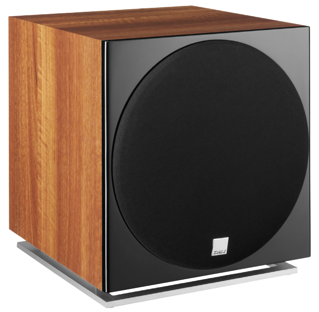
DALI SUB E-12 F