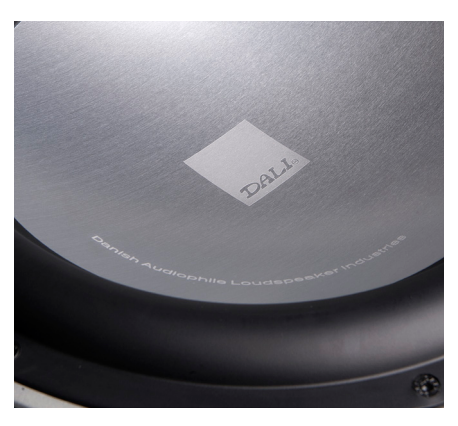
One of the inherent abilities of pure aluminium is an extreme rigidity, measuring a Young's modulus of 69 GPa. In comparison the typical paper cone material measures 4 GPa.

The engine of the woofer is built around an 'oversized' ferrite magnet, and optimized for maximum flux within the voice coil gap. The reason is that it was crucial for the project team to reach a high B/L product to enable the SUB E-12 F to render the finer low frequency details of music, also at a higher sound pressure level. The measured B/L value of 14 N/Ampere is a good indication of the level of control and precision that was reached, and rarely to be found in this category at all. And the numerous listening sessions has truly convinced us that this was the right way to go.