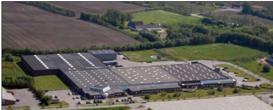
DALI headquarters, Denmark

With a reputation for quality, reliability and integrity, DALI offers an exciting range to suit every taste from the ultimate performance speakers to the cost-conscious series.